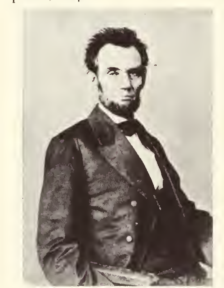
1865 (M-91) O-104