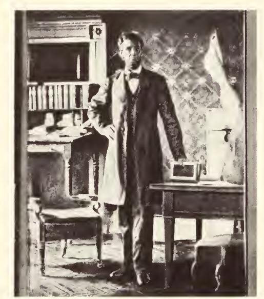
1864 (M-116) O-102 at White House, Washington, D. C., Tuesday, April 26, 1864.