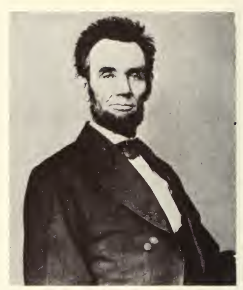
1865 (M-92) O-103