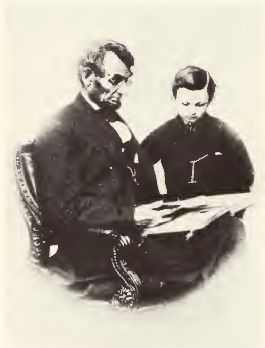
Ostendorf collection O-93