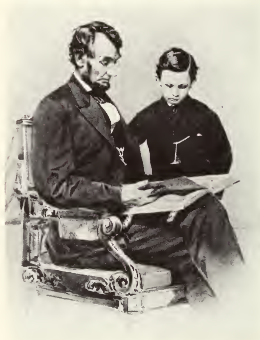
Ostendorf collection Variant O-93