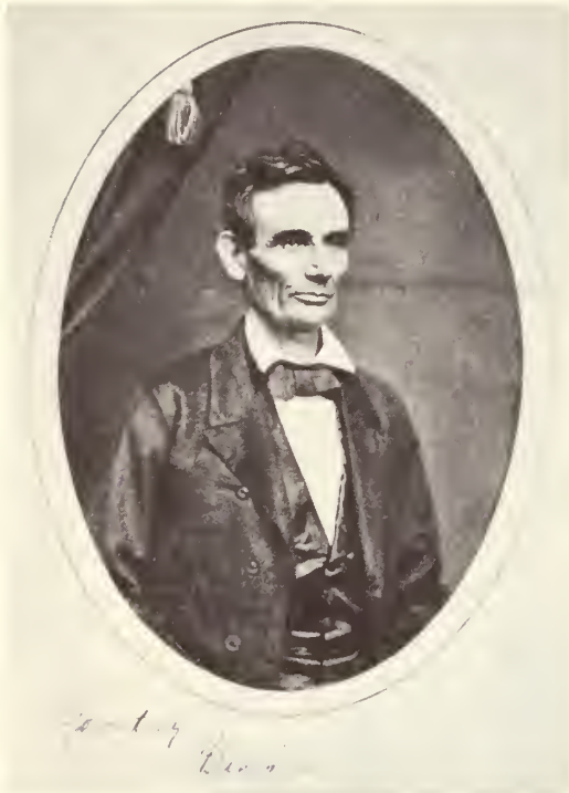
Chicago Historical Society O-14