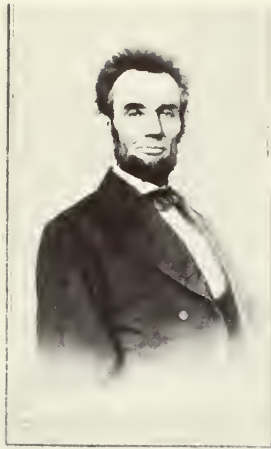
Library of Congress O-103A