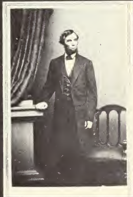
Meserve collection O-69A